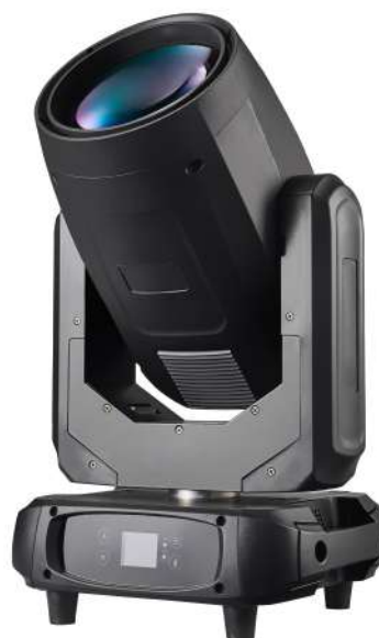
420W Beam Moving Head

ALS X BEAM+ 420 equipped with newly developed Osram 420 Watts high-brightness and long lifespan lamp (3000 hours). With advance optical system, its achieves over 650,000 lux@ 10 meters!, ALS X BEAM+ 420 comes with 14 colors+ open, 17 Static gobos & 3 prisms on 2 independent stack-able prism wheels to create multiple different spectacular prism effect . ( PRISM KING) ! ALS X BEAM + 420 is suitable for various applications from indoor to any large outdoor event ,concert & etc.